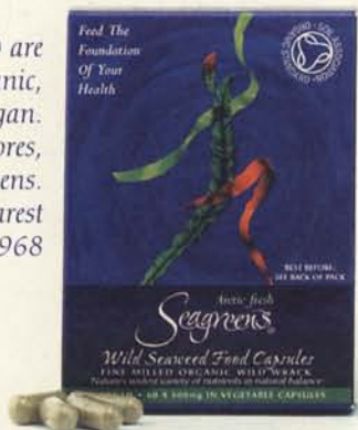
daily 100% vegetable wild seaweed capsules £12.99

Seagreens® are Certified Organic, Vegetarian, and Vegan. Available from health stores, food halls and delicatessens. Or call us for your nearest stockist 0171 723 5968