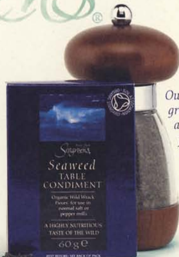
and a tasty wild seaweed table condiment £4.99

Our Table Condiment grinds like pepper, adds a salty-fresh flavour with less sodium than low-salts, and complements a wide range of foods