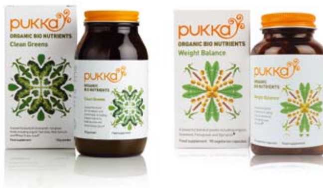
Pukka’s range of Organic Bio Nutrients includes an excellent weight regulation and detox duo ‘Weight Balance’ and ‘Clean Greens’.