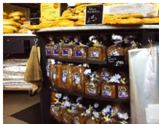
Artisan’s biodynamic bread, available at natural food stores and by mail order, provides extensive consumer information.