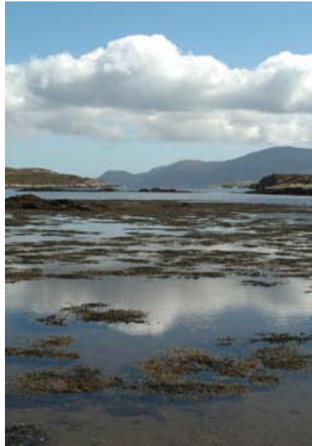
Nature's vegetable garden beneath the waves - Seagreens wrack species in the Scottish Outer Hebrides

This is of special importance in weight management because many weight loss diets and therapies restrict the dietary intake of nutrients.