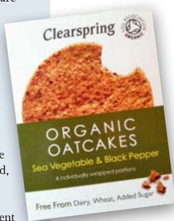
Clearspring’s range of Organic Oatcakes includes ‘Sea Vegetable and Black Pepper’ baked in the Scottish Highlands, using the finest organic ingredients.